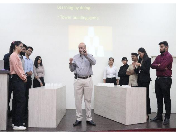
Page 18 of 19